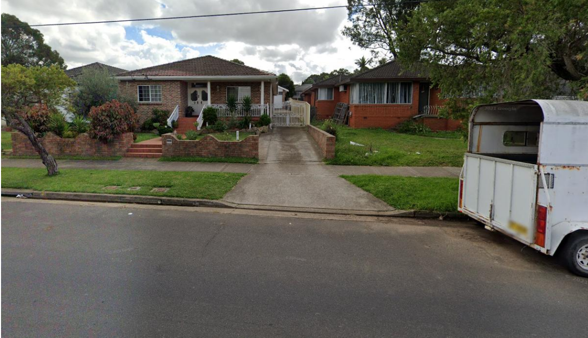
62 Railway parade, Condell Park -Street View

to be used as home business. The lot is rectangular shape with frontage of 14.66m and a depth of 53.35 metres. The total site area is 777m 2 and known as Lot 42 in DP 10809.